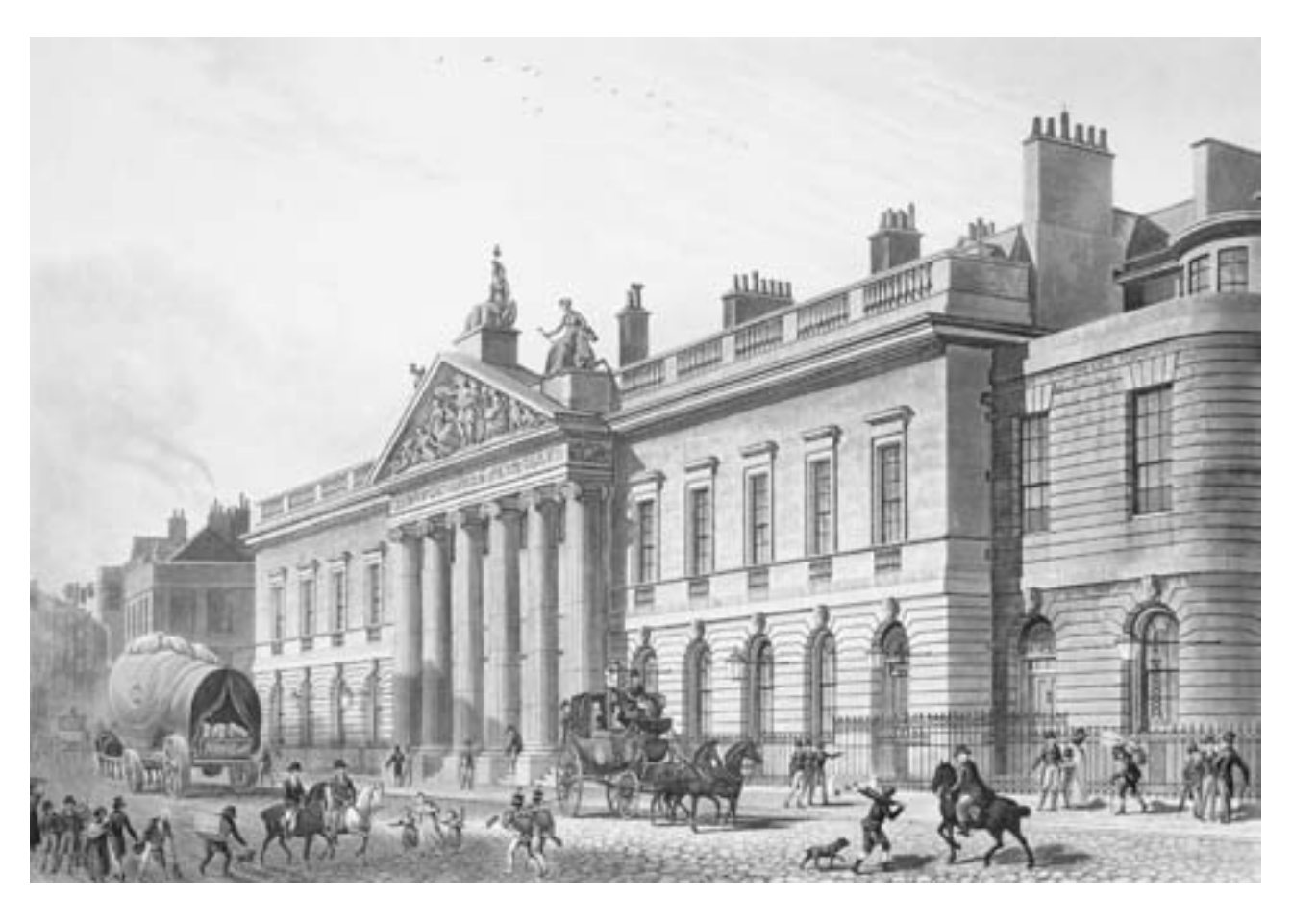
The East India Company ruled British India from East India House until 1858.

among others. By 1834 the company's monopoly of the trade came to an end, and the trade's being open to all comers resulted in the rise of opium sales. In 1832 China imported more than twenty-three thousand chests of opium (with each chest containing between 130 and 160 pounds); the figure rose to thirty thousand chests in 1835 and to forty thousand chests in 1838. These increases drove Western merchants to chafe more blatantly at the Canton System, the Qing government's means of control of foreign trade, in the hope of prying open China's door to the West, and merchants' actions were broadly sanctioned by the British government. After the end of the British East India Company's monopoly, British merchants in China were represented by the superintendent of trade. A government official, the superintendent often refused to deal with the Cohong merchants, demanding instead that he communicate directly with Qing officials. The clash over opium sales thus became not simply a matter between the Oing government and Western merchants but rather one between Qing China and Great Britain.