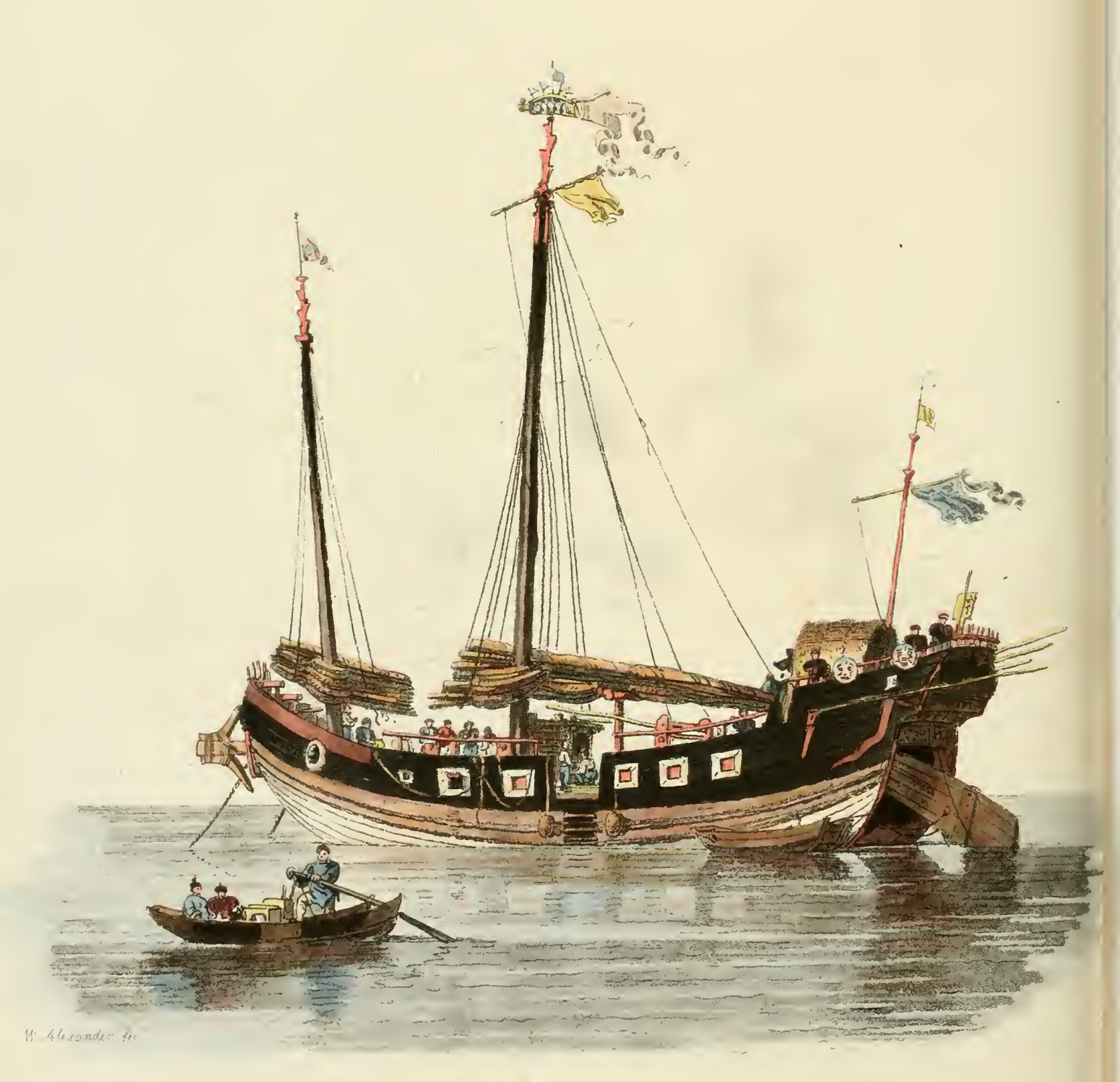
London Pullished dig 3 2 and W Nicol Tollowski.