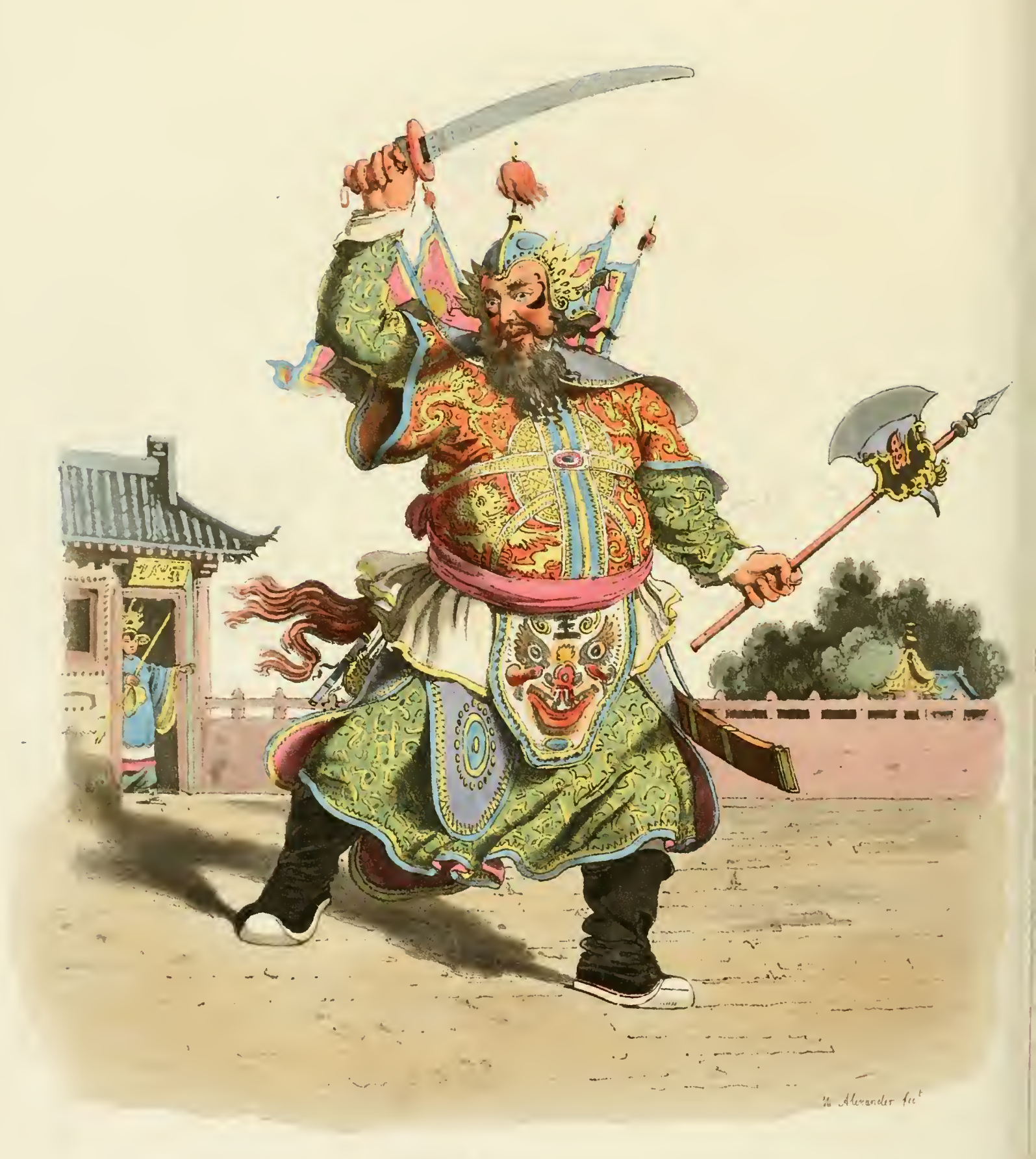
London Tellered Aug " Del og Y and W Need Pallmoll