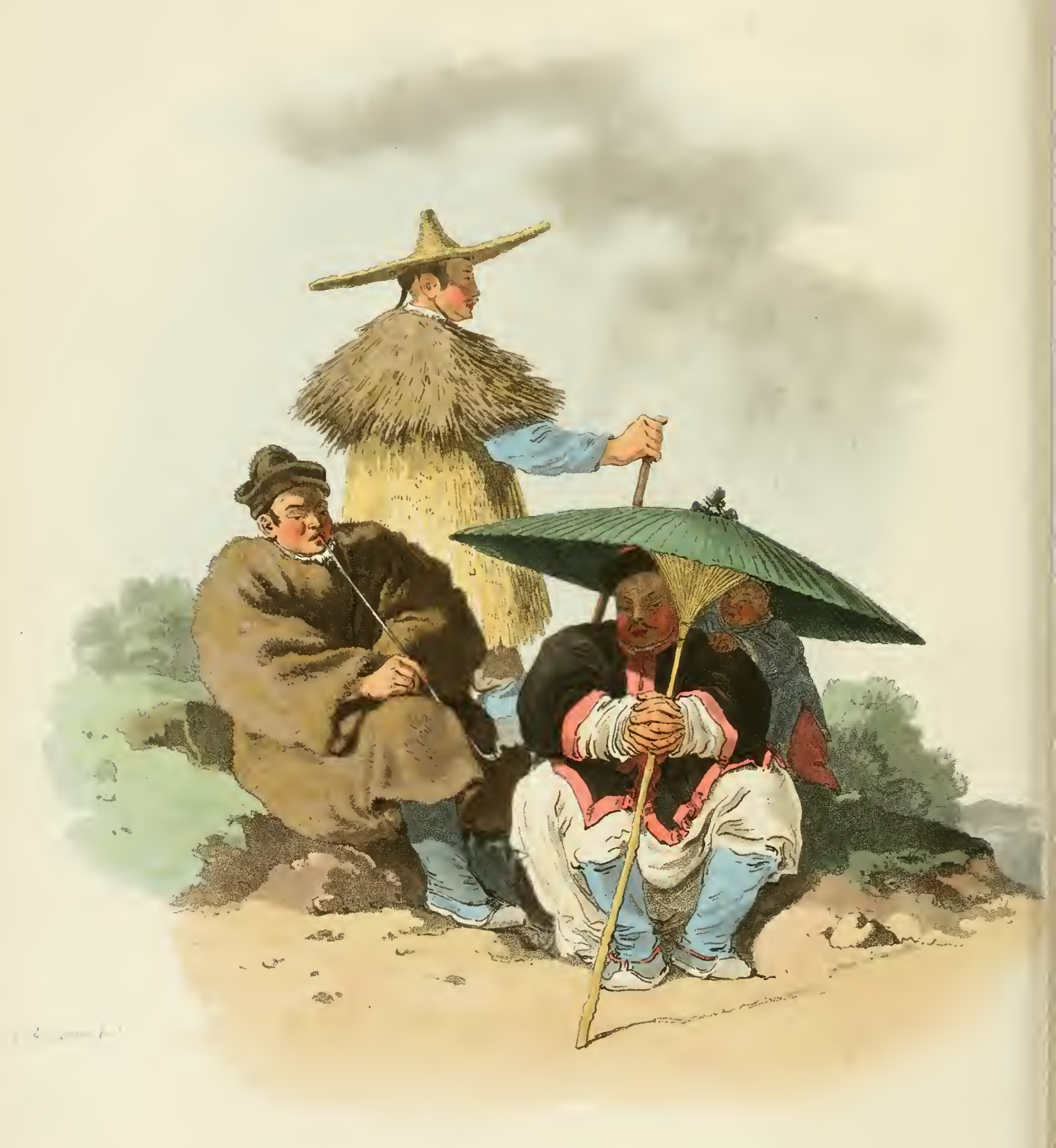
Lir on Tabland Aug = 18 1. my y and W - Vical Pallmall