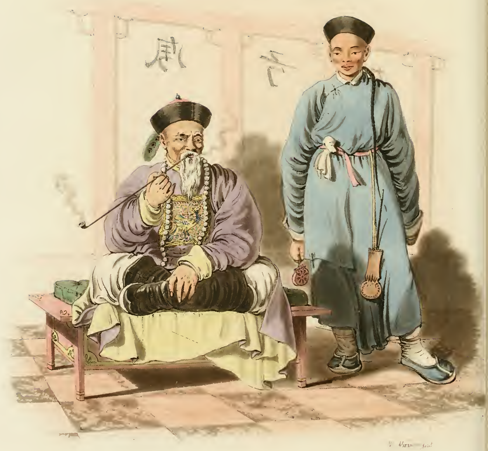
Lower which is a will there is an insert