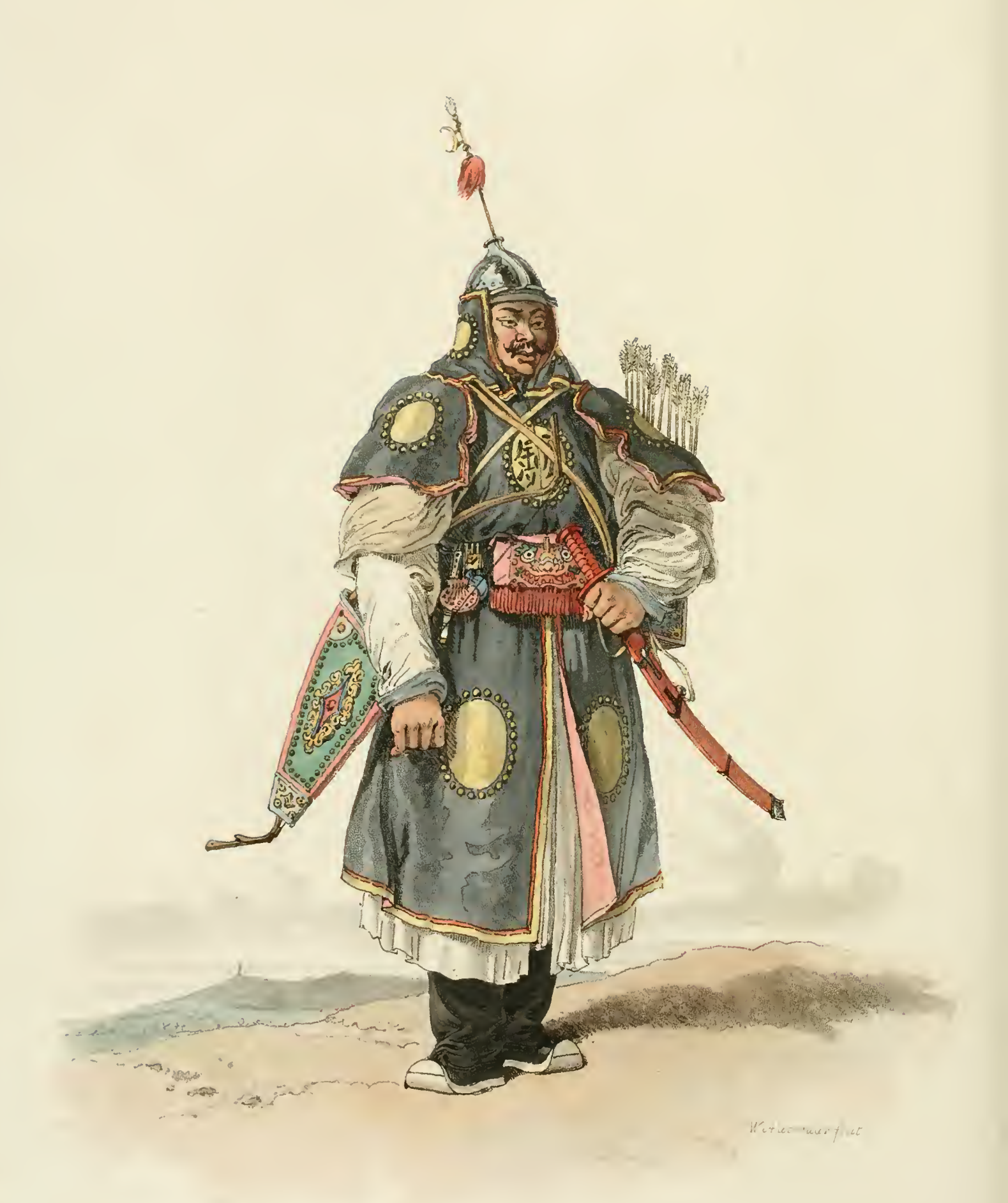
- h - 1 _0 | y | - ' - ' - ' - '