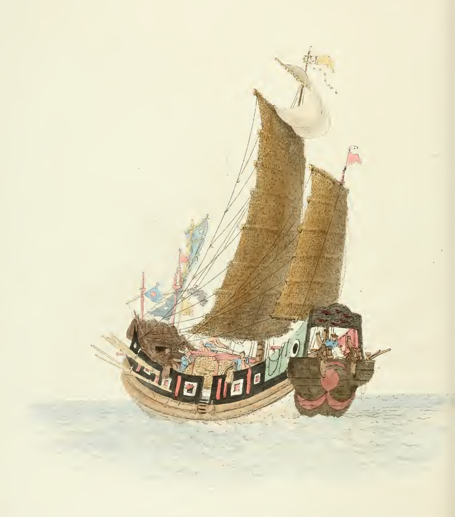
2. The s. Hurch #1/ Je was H. Pallatt.