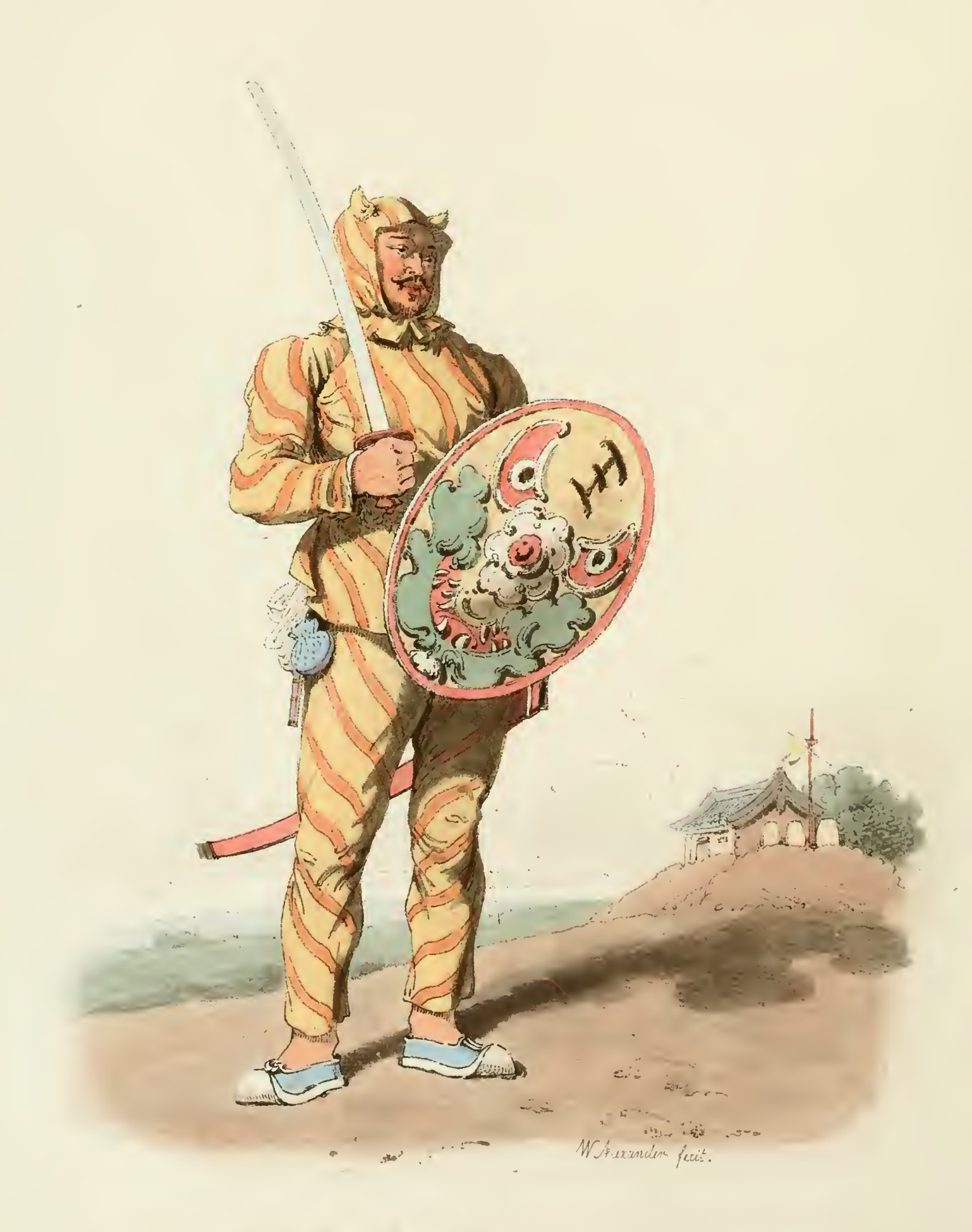
n were struct to mit fried all male