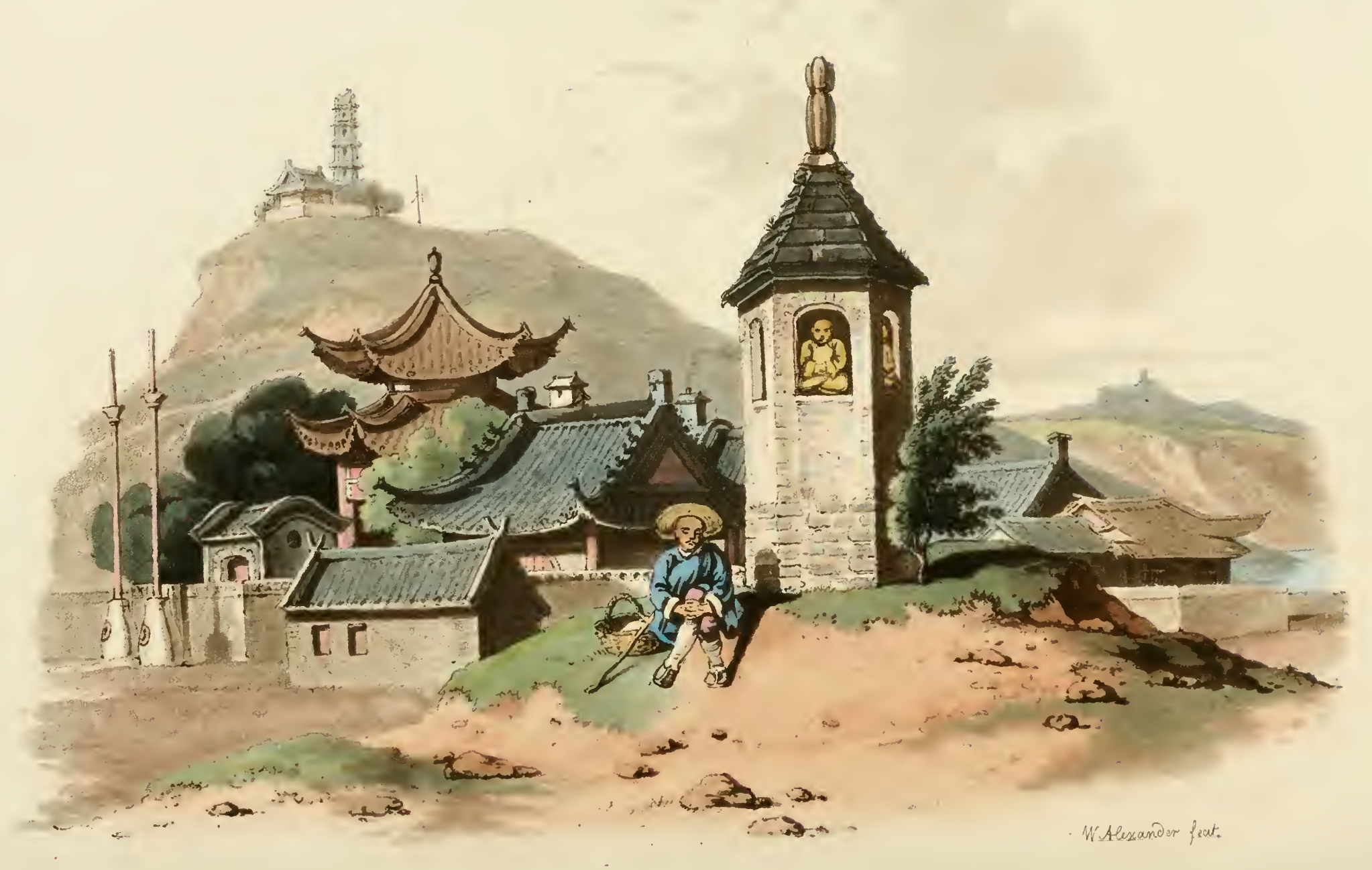
London Published Oct " 1 t 1803 by W Miller Ow Bond Street.