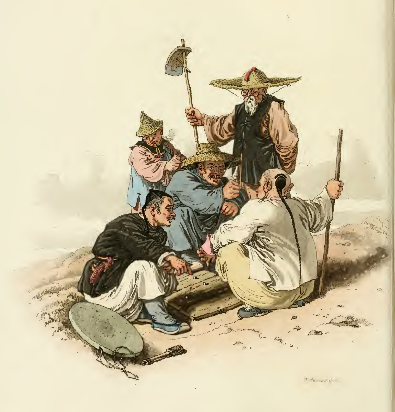
London Published Mari 12 , sy Vice is will