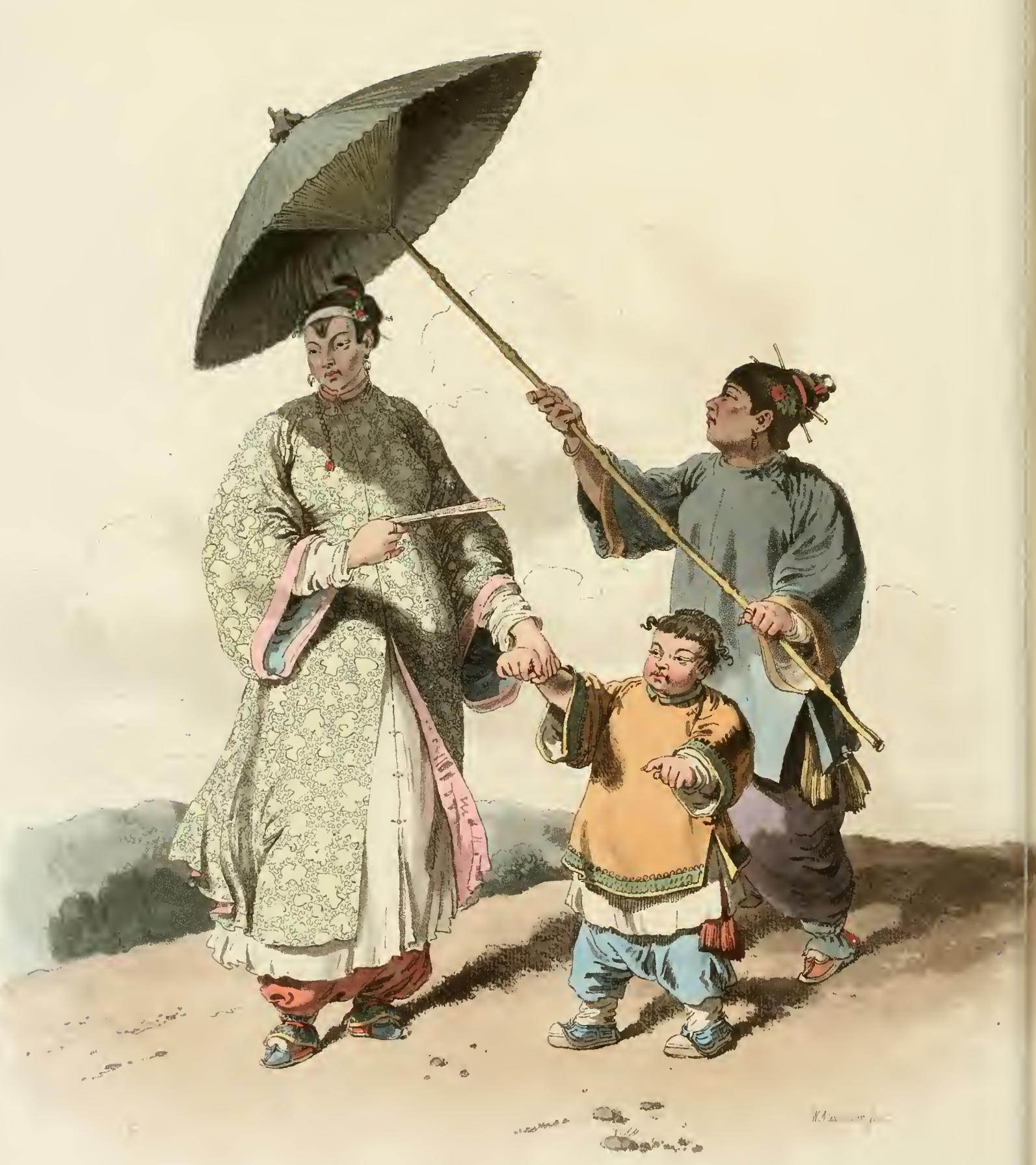
London Published . Sept 1. 1798. by G Nicol Pallmall.