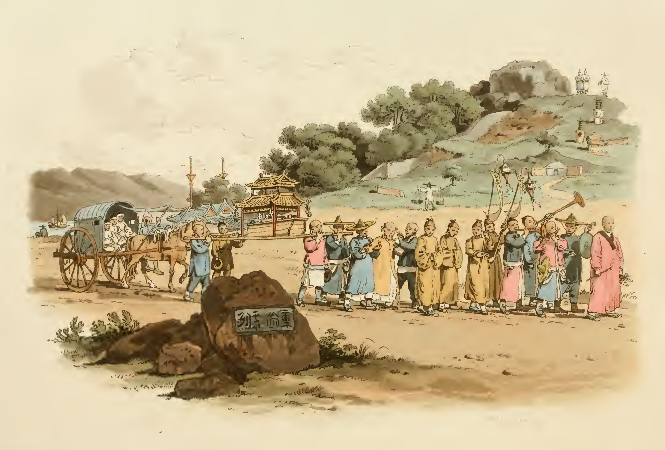
tordon Published Nor" 1st 1 = 0.4 by W. Miller 10 13 . . Threat