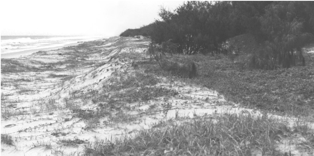
Sand spinifex grass colonising the first and second berm seaward of horsetail she-oak trees growing on the foredune on Bribie Island.

Vegetation plays a dominant role in determining the size, shape and stability of foredunes. The aerial parts of vegetation obstruct the wind and absorb wind energy. Wind velocity near vegetation is thus reduced below the velocity needed for sand transport, and the sand is deposited around the vegetation. A characteristic of dune vegetation, particularly the grasses, growing under these conditions is its ability to produce upright stems and new roots in response to sand covering. Unless the plant continues to grow more rapidly than the rate of deposition, the arresting action of the plant ceases. Successive stages of plant growth and sand deposition result in increased width and height of the dune.