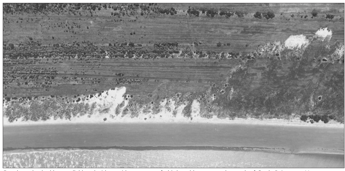
Foredunes backed by parallel beach ridges with remnants of old dune blowouts to the north of Cattle Point, near Yeppoon.

Beach ridges perform the same function as foredunes. They act as a buffer against wave attack and are a source of sand to supply the beach during periods of coastline erosion.