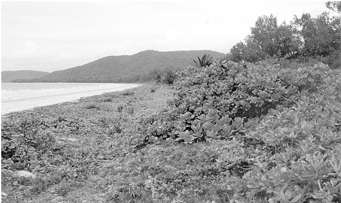
A broad, protected foreshore at Wonga Beach where the herbland includes the sea lettuce tree Scaevola sericea . Directly behind this is the woodland zone dominated by horsetail she-oak Casuarina equisetifolia with coconut palm Cocos nucifera also present.

Further information on this topic is provided in leaflet no.III-07.