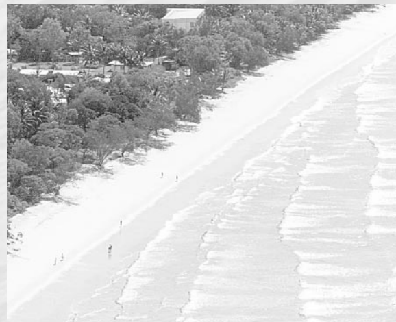
A view of Clifton Beach where the low woodland zone grows right up to the foredune with no distinct zone of herbaceous pioneer plants.