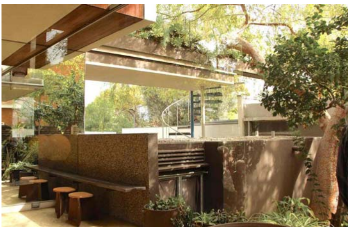
Neutra VDL Studio and Residences, home of architect Richard Neutra.