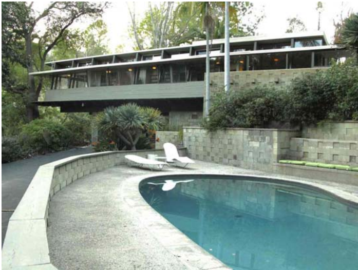
The MHA site office by A Quincy Jones.