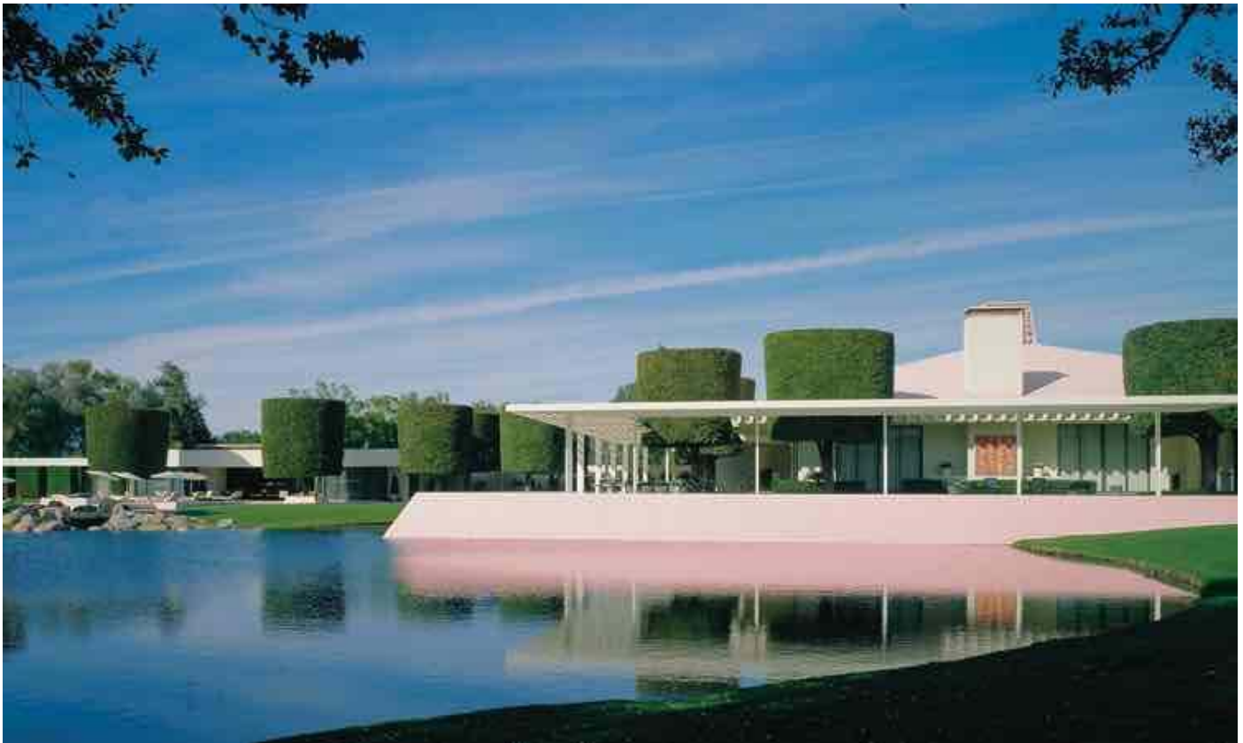
Sunnylands by A Quincy Jones and Frederick E Emmons, 1966.

Created by the masters of modernism, the mid-century homes of California are too small for today's super-rich - hence a conference about how to preserve them