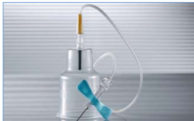
Suitable for BacT / Alert and BacTec blood culture bottles.

In order to provide a complete product line for all requirements, a standard Blood Collection Set (without safety mechanism) is also available with pre-assembled Blood Culture Holder.