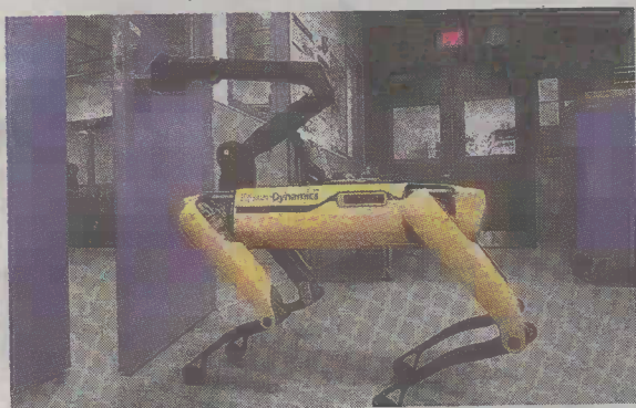
▲ The SpotMini robot is able to turn the handle to open a door with its 'fifth limb' before propping it ajar with its front leg