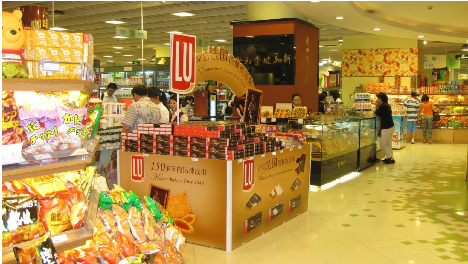
LU biscuit brand in a Chinese supermarket