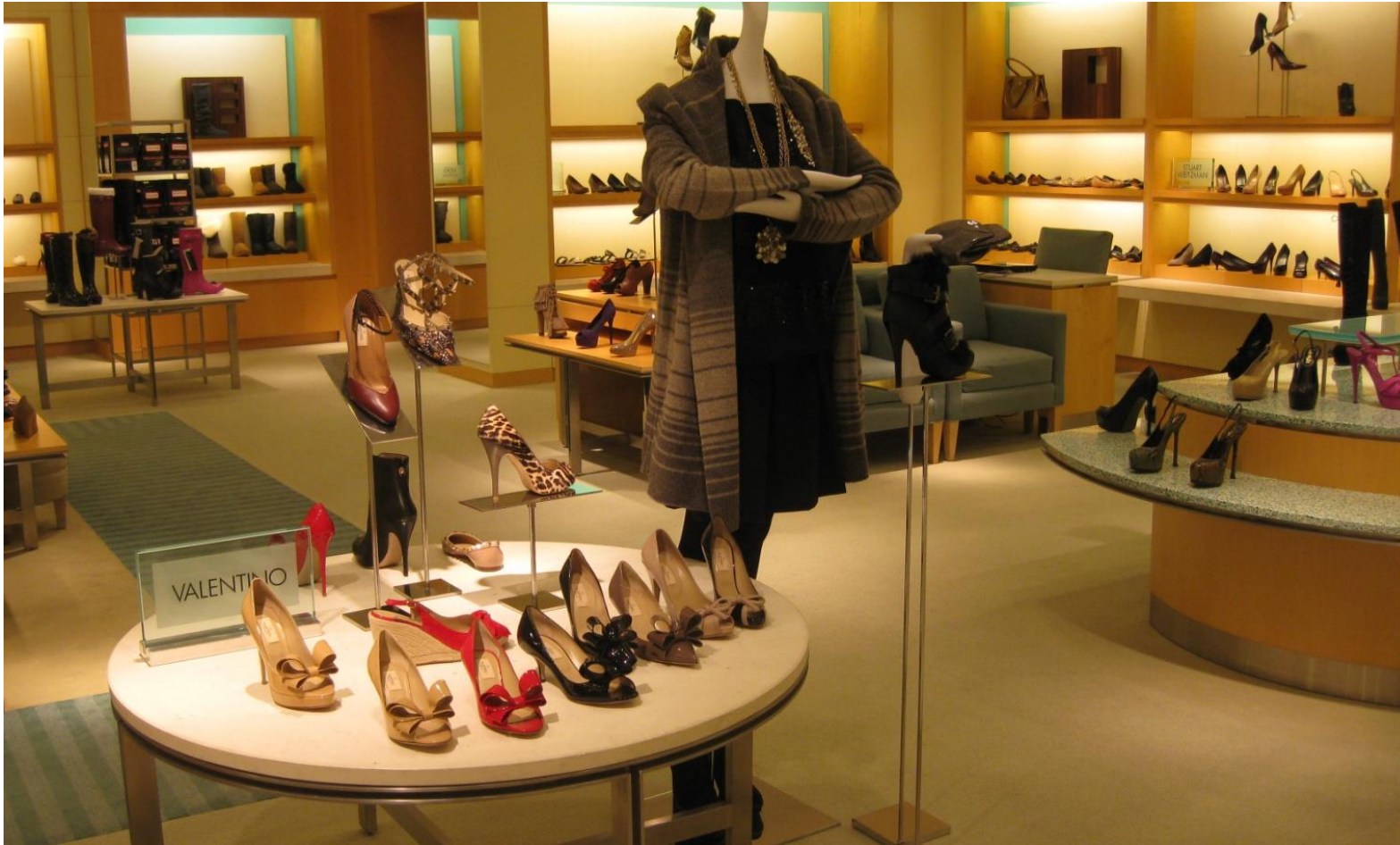
Valentino in Neimann Marcus US department stores