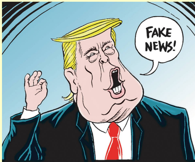
MP REACTS TO DEMOCRAT'S WIN OF THE HOUSE OF REPRESENTATIVES

Fake news is not subjective interpretation of facts. It is the deliberate fabrication of falsities to win over public opinion in a particular aim, usually political, for example, to damage a reputation, or other.