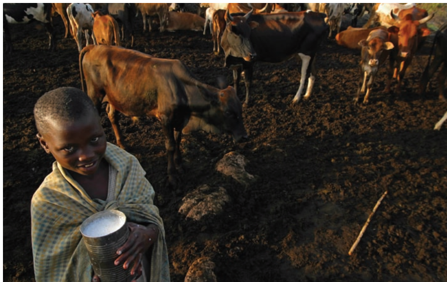
Milk provides many nutrients to those who can tolerate it (see map on opposite page).

However, not all phenotypes can be directly linked to genetic variation. As years of genome-wide association studies have demonstrated, most traits are considerably more complicated and multifactorial in nature, and tracking