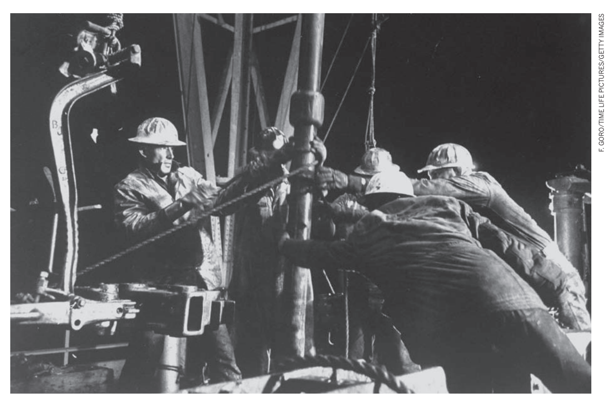
This 1961 effort to drill right through Earth's crust didn't succeed. Half a century on, geologists are ready to try again.

CORRESPONDENCE Three responses to recent special on animal research p.448