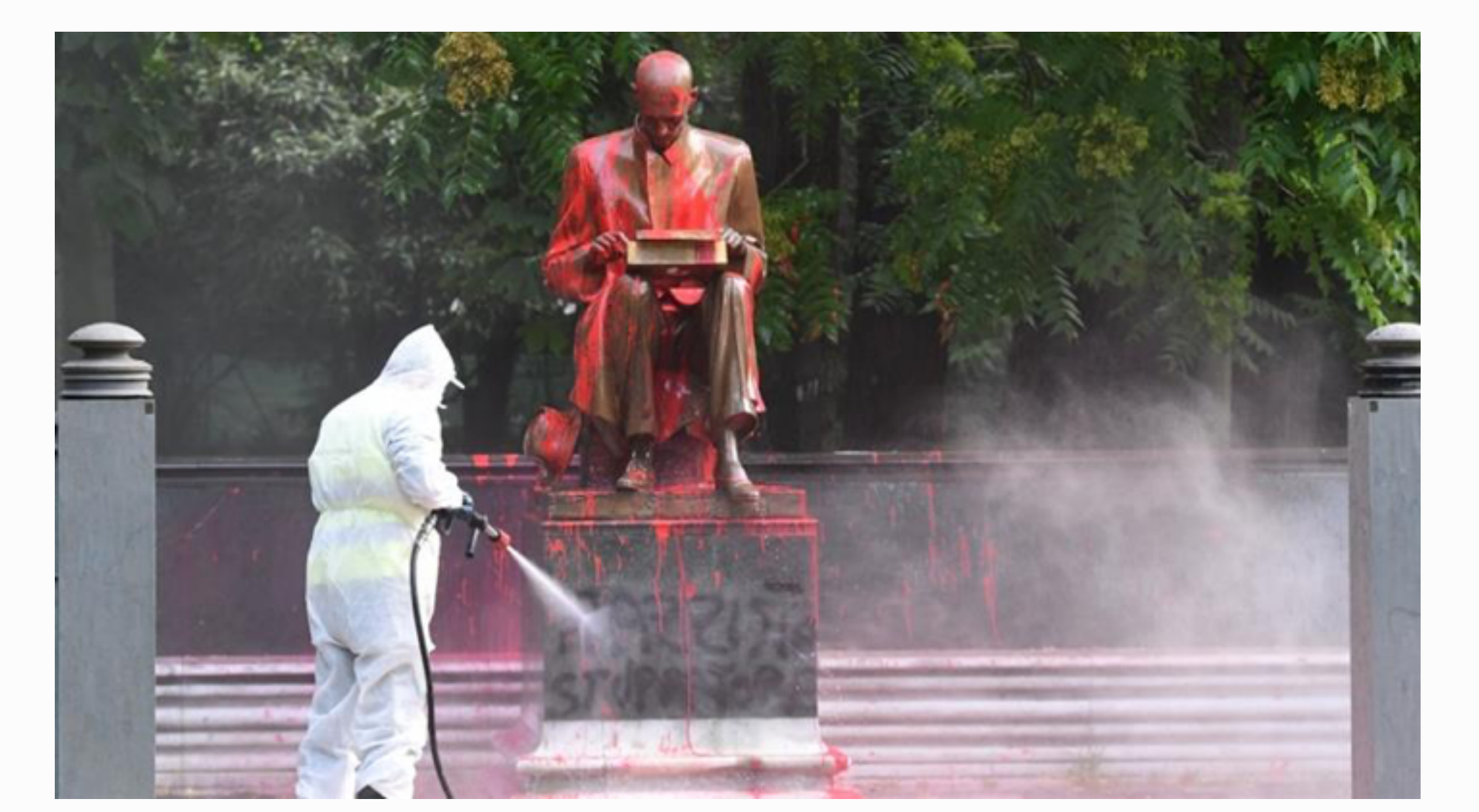
The statue of Indro Montanelli was stained with red paint and tagged with the inscription 'racist, rapist'

been painted red and tagged with the words "racist, rapist", becoming the country's first statue targeted since a wave of similar incidents across Europe and the United States.