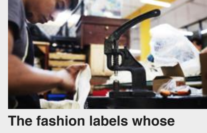
clothes are made by prisoners