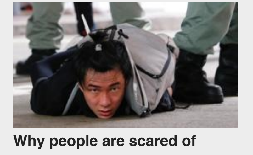
Hong Kong's new law