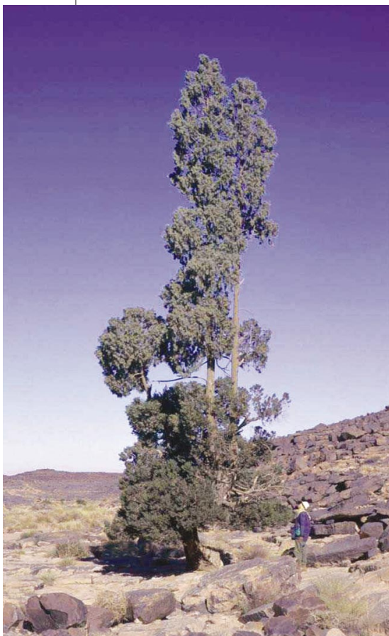
Figure 1 The cypress Cupressus dupreziana is native to the inhospitable Tassili N'Ajjer desert of Algeria and is one of the world's most endangered trees, with only 231 remaining.