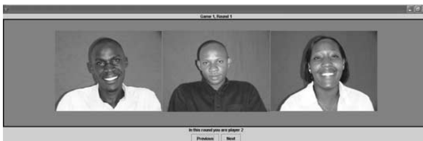
FIGURE 1. Public Information Box with Nonanonymous Offerer

Note: Player 2, the offerer, is "seen" by all players. Note that the images used in this figure are for illustration purposes only and are not the images of actual subjects.