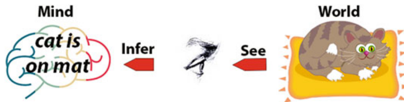
Fig. 5.1 Coordination classes allow reading out information relevant to concepts, here illustrated by “location,” from the world. The readout happens in two stages. (1) “See” or “notice” involves extracting any concept-relevant information: “The cat is above the mat,” and “The cat is touching the mat.” (2) “Infer” draws conclusions specifically about the relevant information (location) using what has been seen: “The cat is on the mat.”

Coordination classes are large and complex systems. This is structurally unlike p-prims, which are “small,” simple, and relatively independent from one another. Alignment poses a strict constraint on all possible noticings (e.g., noticing F_1 or F_2 in Fig. 5.2) and all possible inferences (e.g., I_1 and I_2 ): All paths should lead to the same determination. That is, there is a global constraint on all the pieces of a