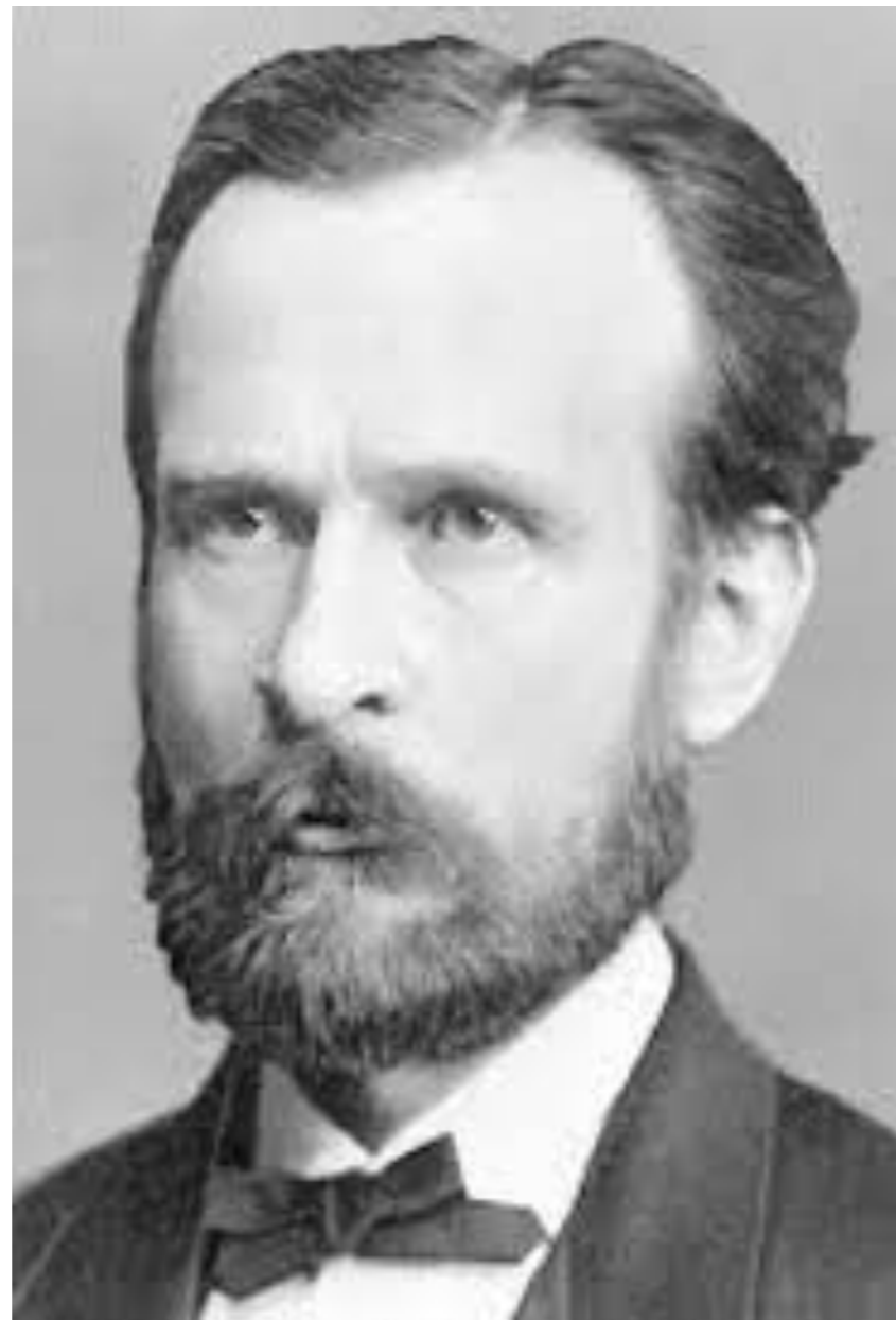
Ferdinand von Richthofen (1833 – 1905)