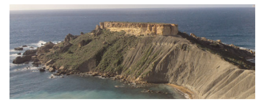
Fig. 3 Il-Qarraba promontory at Ghajn Tuffieha Bay. The superimposition of limestones on clayey terrains favours the onset of rock spreading phenomena and of associated landslides which occur at the edges of the plateaux