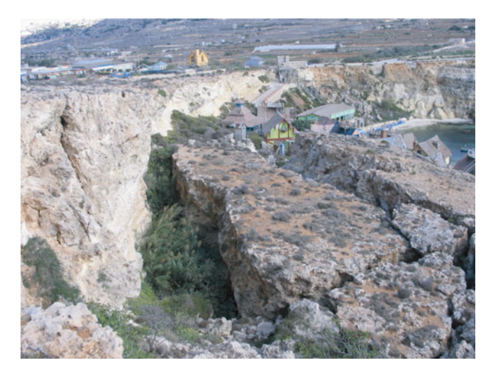
Fig. 6 Evidence of large block sliding occurring at Il-Prajjet (Anchor Bay) as a consequence of rock spreading phenomena affecting the Upper Coralline Limestone Formation

(Magri et al. 2007, 2008) and worth of being monitored for longer periods, in order to define their rate of movement and possible relationships with precipitation patterns.