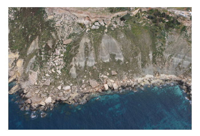
Fig. 4 Evidence of rock falls occurring along the north-western coast of Malta