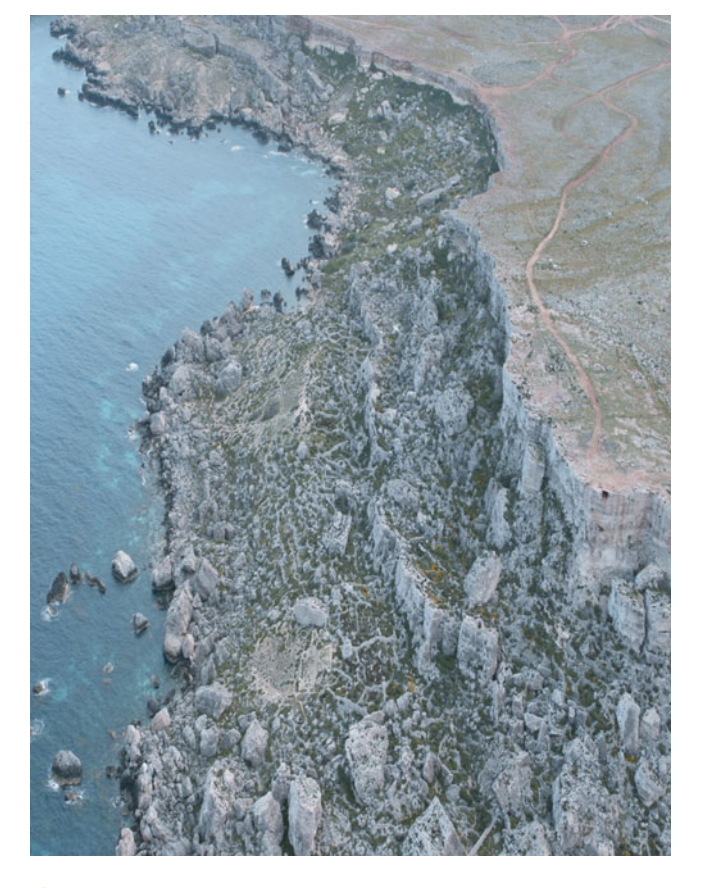
Fig. 2 The superimposition of the Upper Coralline Limestone Formation on the Blue Clay Formation is a predisposing cause of landslide occurrence along the north-west coast of Malta

Rock falls and topples are abundant along the coastline and mainly affect the Upper Coralline Limestones Formation which is characterised by persistent fissures and cracks of tectonic origin, locally widened by lateral spreading