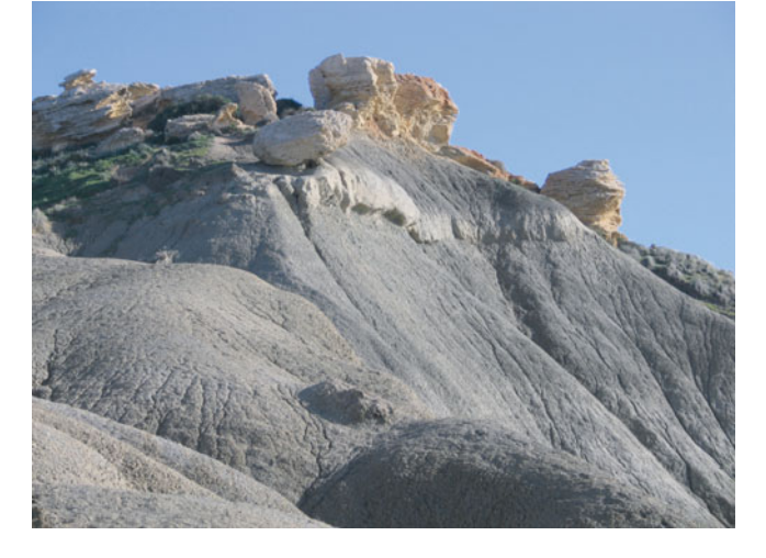
Fig. 7 Hazardous situation south of Il-Qarraba promontory due to the presence of limestone blocks in critical stability conditions. It should be noted that the blocks are overhanging footpaths and beach areas

The trend of movement seems to be sensitive to seasonality, in relation to rainfall distribution, but further data are needed to properly define this issue.