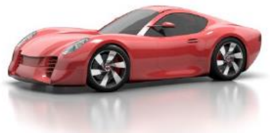
aeroplane / car