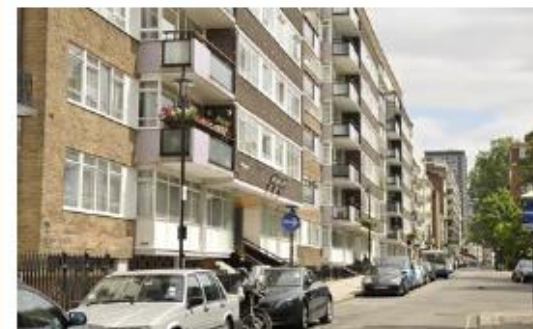
house / flat