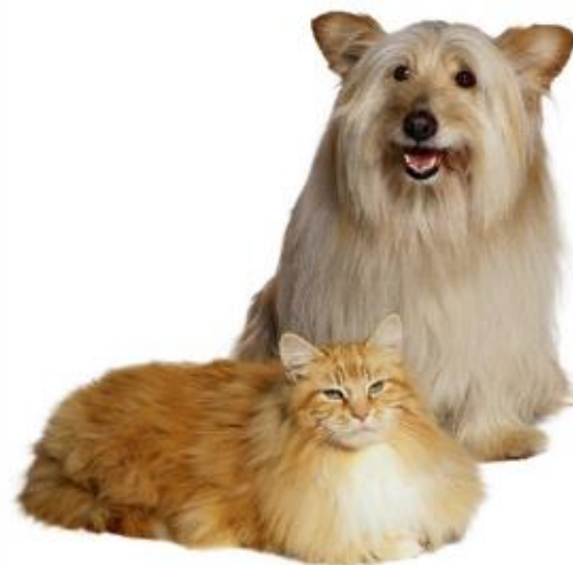
cat / dog