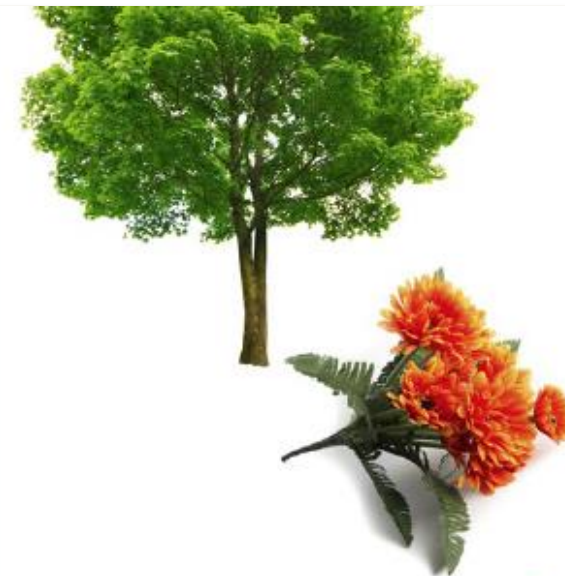
tree / flower