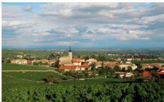
town / country