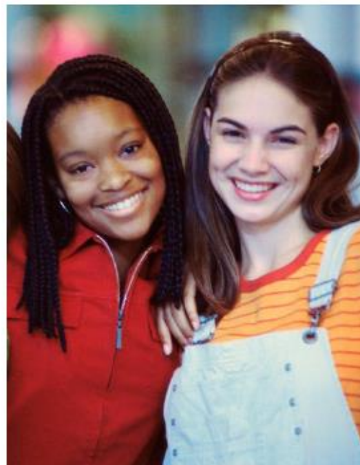
you / a friend