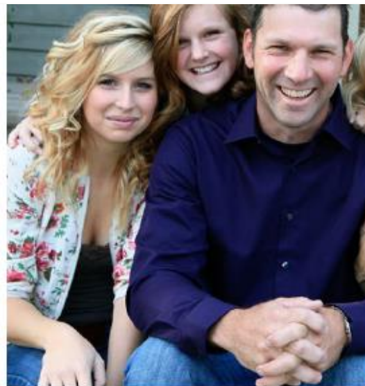
you / a relative