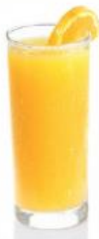
coffee / orange juice