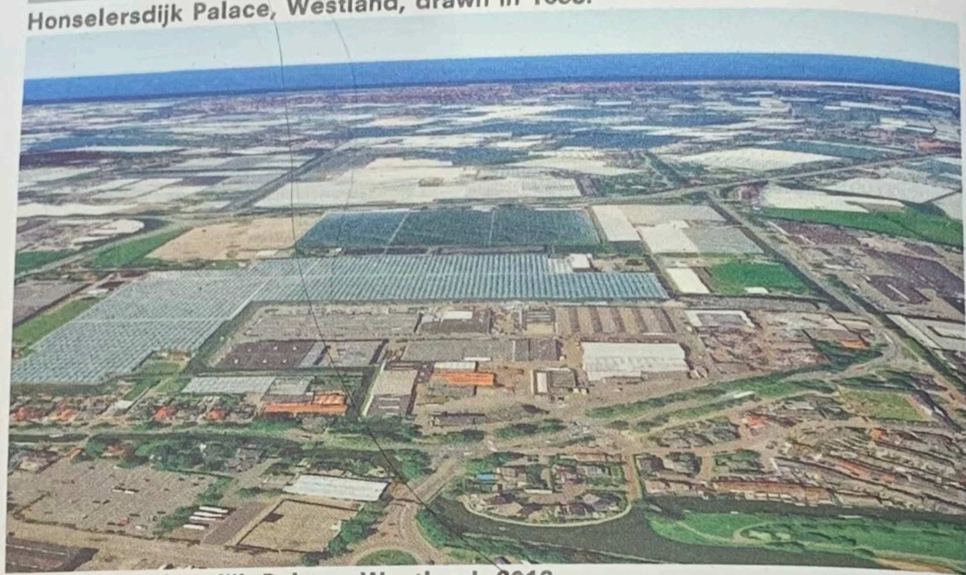
Site of Honselersdijk Palace, Westland, 2019.