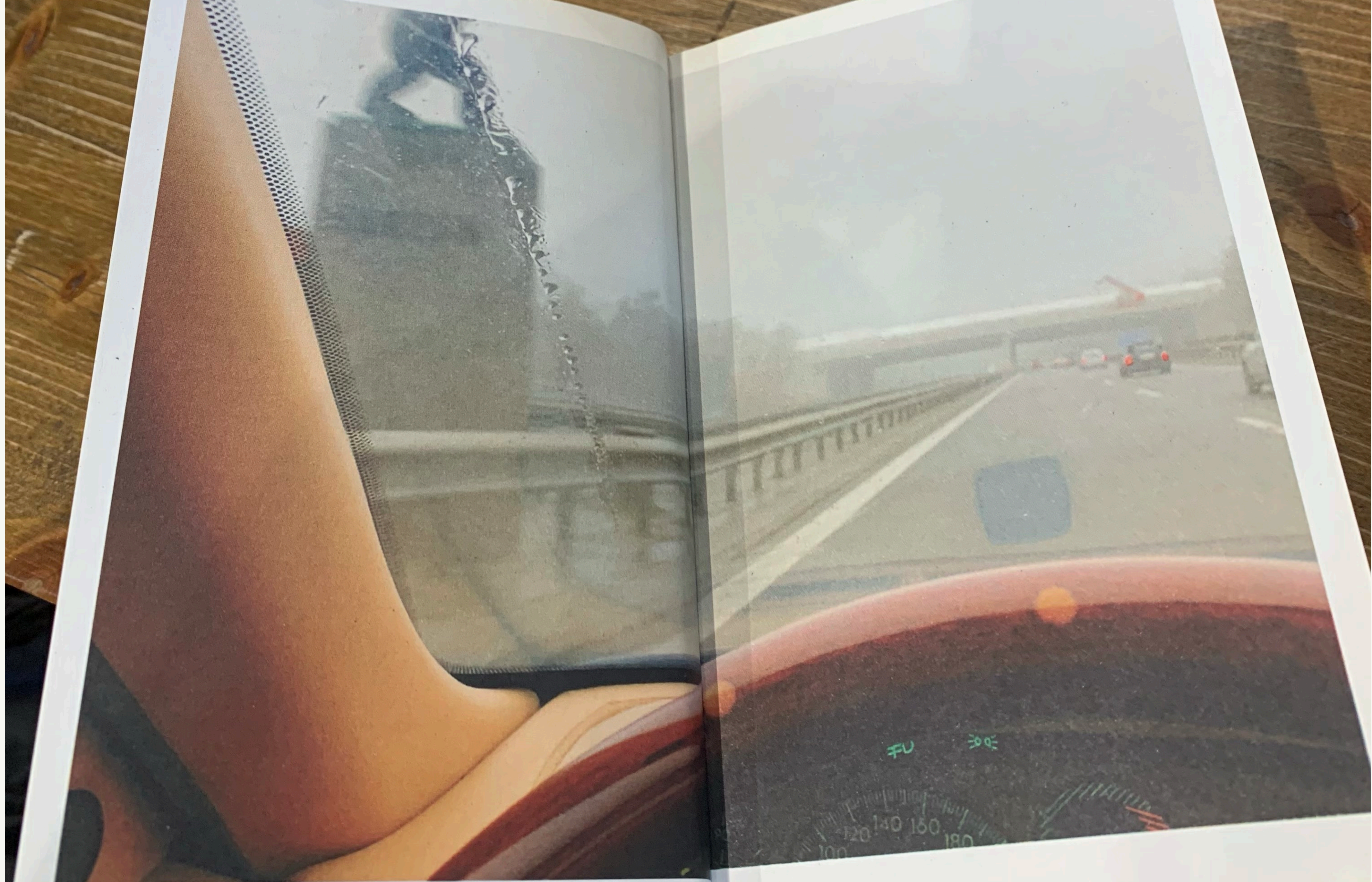
Leaving the city of Berlin, driving south, into the countryside, March 2018.