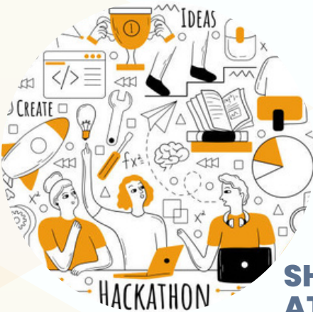
SHIPBUILDING INDUSTRY AT FINCANTIERI