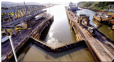
3. PANAMA CANAL 6.8 MILLION METRIC TONS