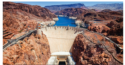
4. HOOVER DAM, ARIZONA AND NEVADA 6.0 MILLION METRIC TONS