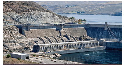
2. GRAND COULEE DAM, WASHINGTON 21.7 MILLION METRIC TONS