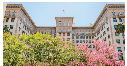
10. WILSHIRE GRAND HOTEL, LOS ANGELES 0.037 MILLION METRIC TONS

DATA SOURCES: ARCHITIZER.COM, U.S. BUREAU OF RECLAMATION, PANAMA CANAL MUSEUM/UNIVERSITY OF FLORIDA