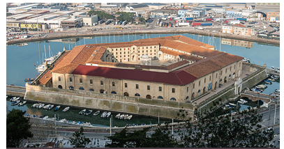
6. THE PENTAGON, WASHINGTON, D.C. 0.80 MILLION METRIC TONS