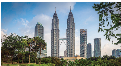
7. PETRONAS TWIN TOWERS, MALAYSIA 0.39 MILLION METRIC TONS