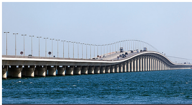
5. KING FAHD CAUSEWAY, SAUDI ARABIA AND BAHRAIN, 0.84 MILLION METRIC TONS