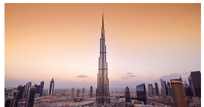
8. BURJ KHALIFA TOWER, UNITED ARAB EMIRATES, 0.11 MILLION METRIC TONS