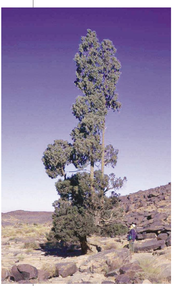
Figure 1 The cypress Cupressus dupreziana is native to the inhospitable Tassili N'Ajjer desert of Algeria and is one of the world's most endangered trees, with only 231 remaining.

The life cycle of plants generally alternates between two generations: the diploid sporophyte that produces haploid spores by meiosis, and the haploid gametophyte that produces gametes. Fertilization of a female gamete by a male gamete gives rise to a zygote that produces an embryo, the new sporophyte. However, in apomictic plants the embryo develops from maternal cells without fertilization<sup>1</sup>. Apomixis has been frequently reported in angiosperms but was