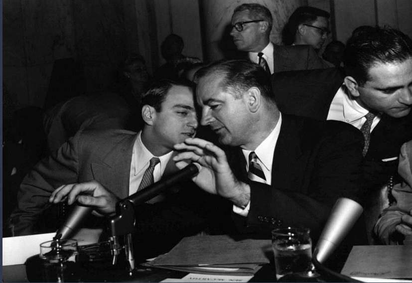
Immagine di Joseph McCarthy che copre il microfono durante un'inchiesta riguardante le infiltrazioni comuniste nel Dipartimento di Stato americano.

Con Maccartismo si intende un particolare atteggiamento politico anticomunista sviluppatosi in America tra il 1950 e il 1954, che si inserisce nella cosiddetta "red scare". Esso prende il nome dal senatore del Wisconsin Joseph McCarthy che, durante un comizio, aveva dichiarato di conoscere i nominativi di numerose spie sovietiche e aveva dato inizio ad una vera e propria "caccia alle streghe". Coloro ritenuti colpevoli di filocomunismo venivano allontanati dal proprio posto di lavoro e isolati socialmente. Il fenomeno termina grazie alla decostruzione delle accuse mosse da McCarthy (poi espulso dal senato) da parte del giornalista Edward Marrow.