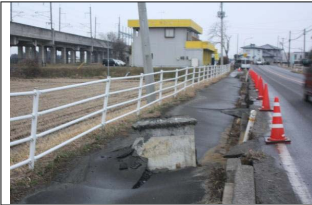
Photo 4: Lifting of a man hole due to soil liquefaction near Shiwahime