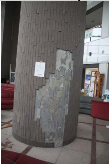
(c) Fall of finishing tiles on a column