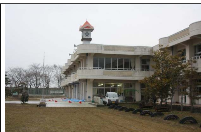
Photo 9: Overall view of Kurihara City Municipal Wakayanagi Elementary School

No damage was observed in the two story reinforced concrete Kurihara City Municipal Wakayanagi Elementary School Building, supported by pile foundation. Due to the soil settlement, 20 cm deep opening was observed (Photos 9 and 10). A statute fell down (Photo 11). The school master said “the large motion was felt in the east-west direction. The length of piles was told to be 30 m.” The gateposts of the Kanro-ji temple fell to the west near the school (Photo 12), and a large masonry lantern fell in a similar manner. The dominant frequency of the (H/V) ratio of horizontal to vertical spectra of micro tremor measurements at the Wakayanagi Elementary School after the 2008 Iwate-Miyagi Inland Earthquake was observed to be 0.8 Hz. In the neighborhood of the school, utility poles were tilted (Photo 13), cracking on the road, severe tilting of a timber house (Photo 14) in the second story were observed,