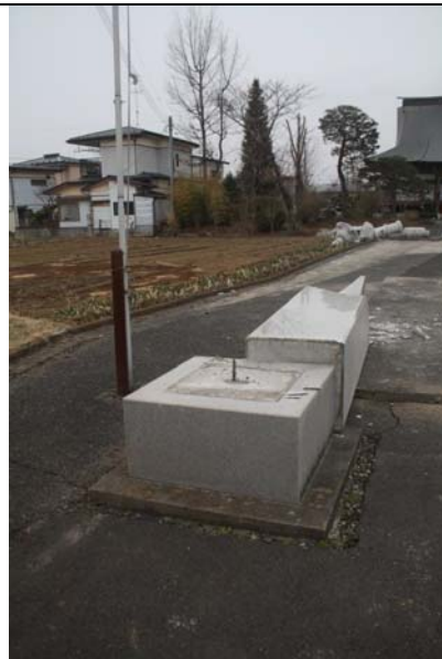
Photo 12: Fall down of two gateposts of the Kanro-ji temple to west