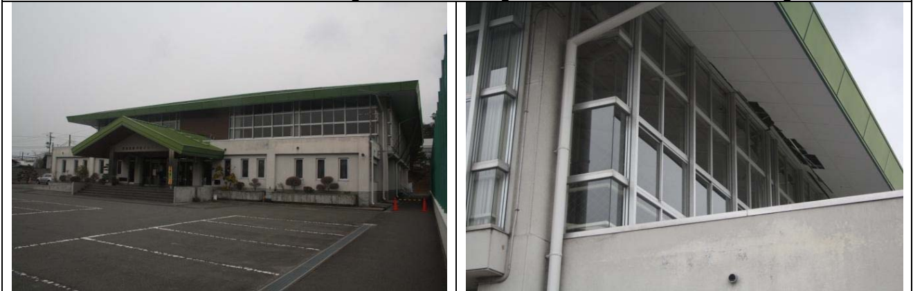
Photo 3: Tsukidate Gymnasium Center Building with minor non-structural damage