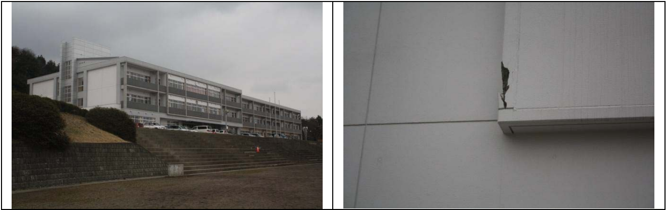
Photo 2: Tsukidate Junior High School Building with minor non-structural damage