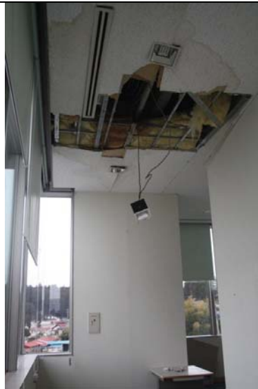
(d) Fall of ceiling of Municipal Assembly Hall (2)