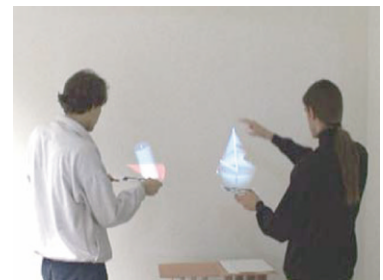
Fig. 3. Left: Demonstration of the mobile AR kit at a local science fair. Middle: Schema of the Augmented Classroom setup. Two mobile users interact with a construction while a third user inspects a finished model on a projection screen. Right: Interacting with models in front of a projection screen.