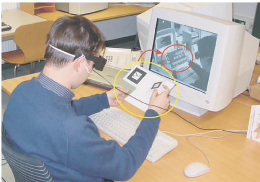
Fig. 4. A user working with our desktop VR system. A FireWire camera (out of view) is used for optical tracking of the hand held props which are equipped with markers (see yellow ellipse). The image of the camera is used as a video background. Stereoscopic images are displayed on the monitor which give the user who wears shutter glasses the impression of working in 3D space. The virtual images of pen and PIP can be seen on the monitor (red ellipse) as an overlay over the video image.

Although the advantages of co-located collaboration are lost, the same systems can be used for remote collaboration through a remotely shared 3D space. For example, a teacher can remotely advise a student at a homework problem by the same guided construction techniques as in the AR-classroom scenario, or multiple students can remotely work together. Each of the users has an individual choice of input and output facility,