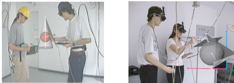
Fig. 1. Students are working with Construct3D in our standard lab setup. In the left image they inscribe a sphere in a cone, the right image shows a simple example from vector algebra. Images generated as live video capture with computer overlays.

educators are interested in simple construction tools that expose the underlying process in a comprehensive way.