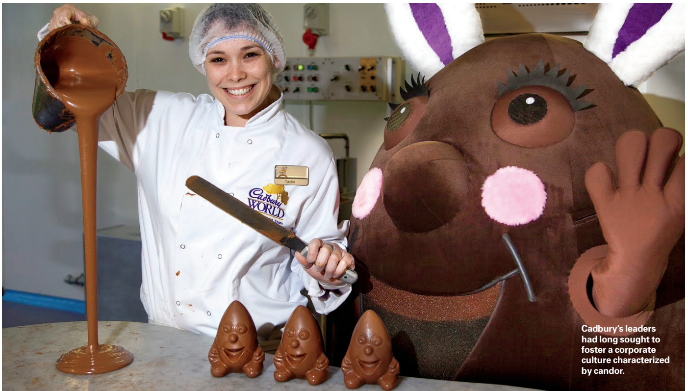
Cadbury's leaders had long sought to foster a corporate culture characterized by candor.