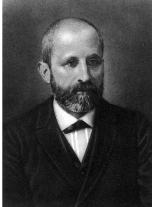
Fig. 6. This picture of Friedrich Miescher in his later years is the frontispiece on the inside cover of the two volume collection of Miescher's scientific publications, his letters, lecture manuscripts, and papers published posthumously by Wilhelm His and others (His et al., 1897a,b).

After Miescher's initial description in his 1871 paper (Miescher, 1871d), other scientists also started investigations into nuclein. Mostly chemists, often through personal contacts with Miescher or Hoppe-Seyler, were intrigued by its potential as a novel kind of cellular substance—among them Albrecht Kossel (1879, 1891), Jules Piccard (1874), and Jakob Worm-Müller (1874). Most notably, Albrecht Kossel—another scientist in Hoppe-Seyler's laboratory and later winner of the Nobel Prize in Medicine—discovered that nuclein was comprised of four bases and sugar