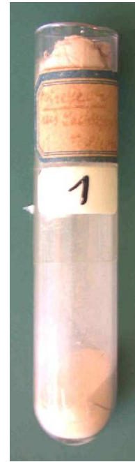
Fig. 5. Glass vial containing nuclein isolated from salmon sperm by Friedrich Miescher while working at the University of Basel. The faded label reads “Nuclein aus Lachssperma, F. Miescher” ( Nuclein from salmon sperm, F. Miescher). Possession of the Interfakultäres Institut für Biochemie (Interfaculty Institute for Biochemistry), University of Tübingen, Germany

In the spring of 1872, Miescher presented his results on sperm to the Naturalist Society in Basel (His, 1897b). Among descriptions of the spermatocyte morphology, he reported