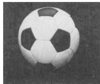
Fig. 1 A football (in the United States, a soccerball) on Texas grass. The C 60 molecule featured in this letter is suggested to have the truncated icosahedral structure formed by replacing each vertex on the seams of such a ball by a carbon atom.

graphite fused six-membered ring structure. We believe that the distribution in Fig. 3c is fairly representative of the nascent distribution of larger ring fragments. When these hot ring clusters are left in contact with high-density helium, the clusters equilibrate by two- and three-body collisions towards the most stable species, which appears to be a unique cluster containing 60 atoms.