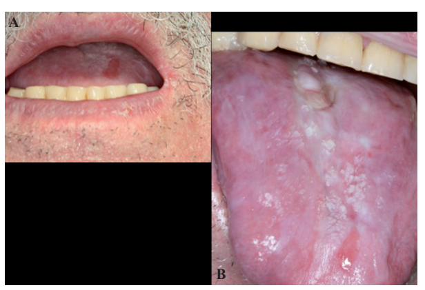
Fig. 2. Clinical features of oral cGVHD. Mouth opening restriction due to sclerosis (A) and lichenoid lesions on tongue (B).

In the presence only of the abovementioned distinctive clinical features, the diagnosis of oral cGVHD could be established without the need for a biopsy provided we have radiological, histological or serological confirmation of the presence of cGVHD in other body organs.